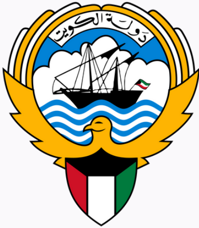
وزارة الدفاع Ministry of Defense

We have had the privilege of working with several key government sectors in Kuwait, These collaborations have allowed us to contribute to the enhancement of healthcare services within the public sector.